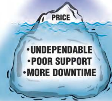
Price is just the tip of the iceberg when evaluating a lift purchase. Beware of hidden future problems.